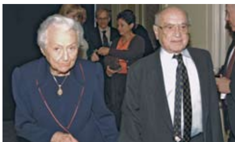
Rose and Milton Friedman at the Power of Choice premier.

Over 300 guests from across the nation gathered for dinner at the Ritz-Carlton in San Francisco to catch a sneak preview of the PBS documentary, and to hear special tributes to Dr. Friedman's